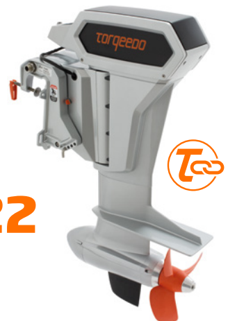
CRUISE 6.0 T/R*